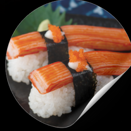
> KANI NIGIRI