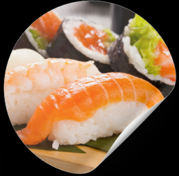
> SALMON NIGIRI