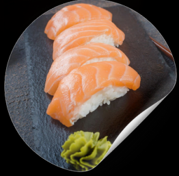
> SALMON SPECIAL NIGIRI