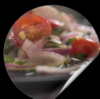
TILÁPIA CEVICHE 3oz