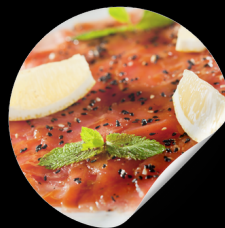
➤ TUNA CARPACCIO (10 Thin slices of tuna fish with ponzu sauce)