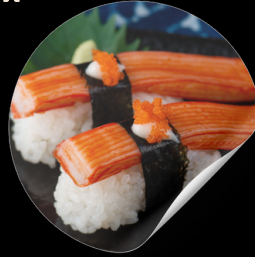
➤ KANI NIGUIRI