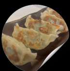
GYOZA (STEAM) Chicken Gyosa