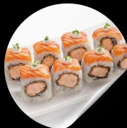
SPECIAL (SALMON CREAM)