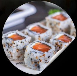
PHILADELPHIA (SALMON, CREAM CHEESE AND CHIVES)