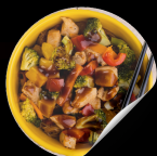
BEEF YAKISSOBA 6oz