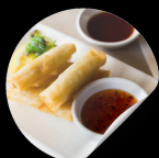
SALMON HARUMAKI (W/ CREAM CHEESE)