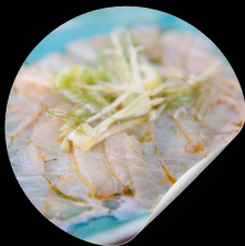
➤ WHITE FISH CARPACCIO (10 Thin slices of white fish with ponzu sauce)