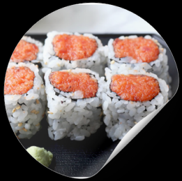
SPICY TUNA (TUNA WITH SPICY MAYO)