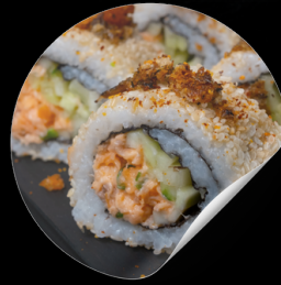
SALMON SKIN (SALMON SKIN AND CREAM CHEESE)