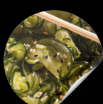
CUCUMBER SUNOMONO 3oz