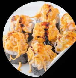
VULCANO (SALMON CREAM, TOPPED WITH KANI AND SPICY MAYO)