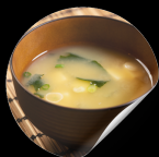
MISO SOUP TOFU 3oz