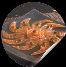
➤ SALMON CARPACCIO ( 10 Thin slices of salmon with ponzu sauce)