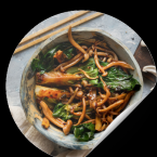
MUSHROOM SHIMEJI 10oz