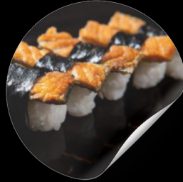
➤ SKIN NIGUIRI