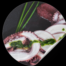
➤ OCTOPUS CARPACCIO (10 Thin slices of Octopus with ponzu sauce)