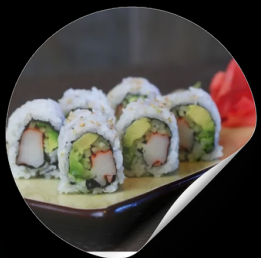
CALIFORNIA (KANI, CUCUMBER AND AVOCADO)